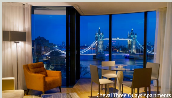
Cheval Three Quays Apartments

London is one of the world's most-visited cities, famous for its history, culture, fashion and entertainment. The Edwardian Group London offers a collection of eleven privately owned hotels, ranging from bijou boutique to large-scale luxury. Alternatively, to experience a home away from home, Cheval Residences are London's market leader in luxury serviced apartments. The group of eight properties offer a portfolio of over 500 apartments ranging from studio, one, two and three bedrooms with 24 hour concierge and maid service daily.