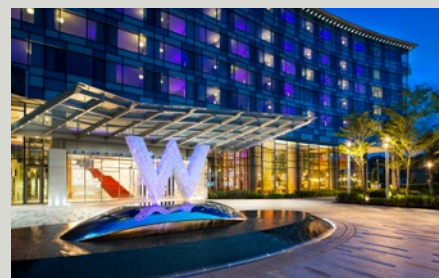
W SINGAPORE SENTOSA

3 Nights in a Classic Room including breakfast from $625 per person share twin