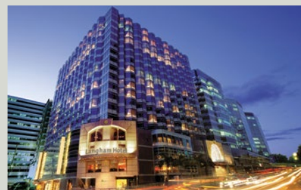
THE LANGHAM HONG KONG

3 Nights in a Superior Room from $549 per person share twin