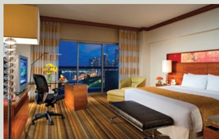
SWISSOTEL THE STAMFORD

3 Nights in a Deluxe Room from $479 per person share twin