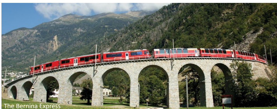
The Bernina Express

Book a Eurail Global or Eurail select Pass by 28 December 2015 & receive 20% off