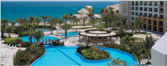
SHANGRI LA BARR AL JISSAH RESORT & SPA

The hotel has spacious guestrooms and suites featuring stunning view of the Sea of Oman and its dramatic coastline, designed to reflect the enchanting Arabian spirit of traditional Oman. Al Waha is one of three hotels at the Barr Al Jissah Resort and Spa, nestled in between the backdrop of rugged mountains and the pristine waters of the Sea of Oman.