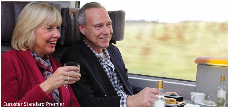
Eurostar Standard Premier

Eurostar is the number one choice for travel between the heart of London and the heart of Paris or Brussels via the Channel Tunnel, with new destinations now available travel direct from London – Avignon or Marseille in the South of France. Eurostar offer a range of discounted fares, however get in early so you don't miss out, sales open 6 months in advance of the trains departure date.