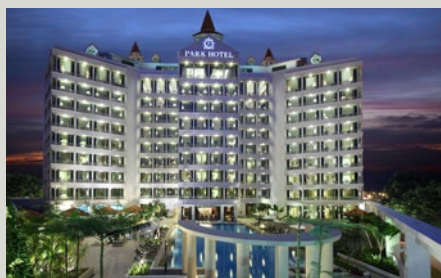
PARK HOTEL CLARKE QUAY

Situated in one of the city's most popular entertainment districts, the 4 star Park Hotel Clarke Quay offers guests great facilities in a fantastic location. Cosy rooms feature modern furnishings with a classic touch, as well as a full range of lifestyle and business amenities.