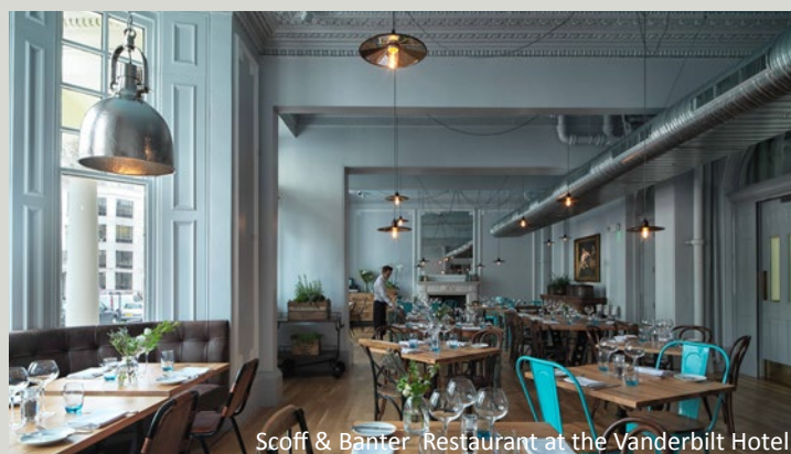
Scoff & Banter Restaurant at the Vanderbilt Hotel

Radisson Blu Edwardian Hotels are well known for their convenient central London locations and proximity to tube stations, providing easy access to the whole city. This group of 4 and 5 star hotels offer complimentary Wi-Fi throughout, chic bars and restaurants and state-of-the-art facilities including front desk and tour services, fitness centres and business centres.