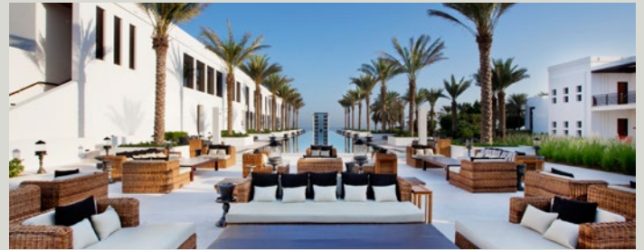
THE CHEDI MUSCAT

3 Nights in a Al Waha Superior Room from $599 per person share twin