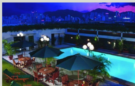
HOLIDAY INN GOLDEN MILE

3 Nights in a Deluxe Room from $359 per person share twin