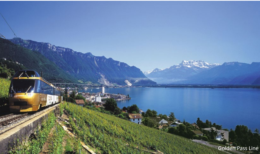
Golden Pass Line

What would you rather do? Trek to the outskirts of town, drag your luggage through a crowded airport, contend with cranky security staff, wedge yourself into an airline seat and arrive exhausted...or stroll through an elegant train station in the city centre, take a comfortable seat in your carriage, travel at speeds of up to 300km/ph, enjoy the scenery and arrive relaxed and with more time to enjoy your destination. Your call!